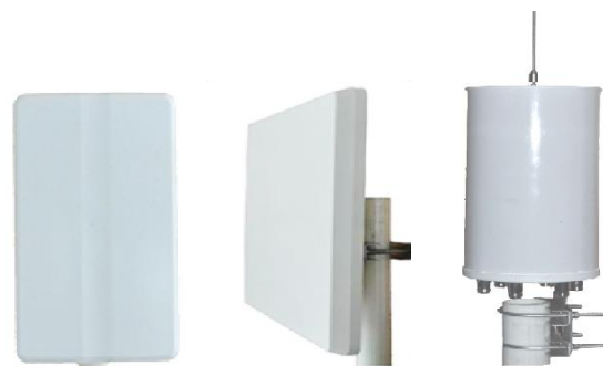
Outdoor Antennas (from left to right):