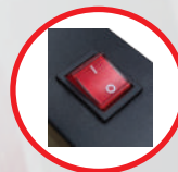
Lighting Switch w/Guard