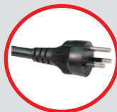
Plug Type TIS 166-2549