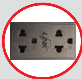
TIS Outlet w/Eye Shutter