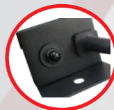
Electronic Circuit Breaker