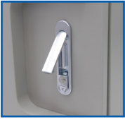
Push Handle Lock