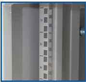
Mounting Pole w/Screen UH