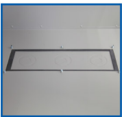
3 Knock Out Holes