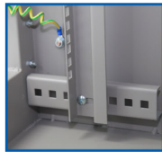
Mounting Pole Can be Adjusted