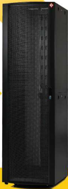
Single Front Door