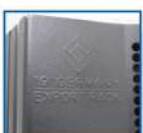
Front Door w/logo