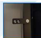
Rack Connected Plate