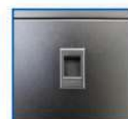
Slide Latch w/logo