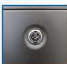
Security Cam Locks