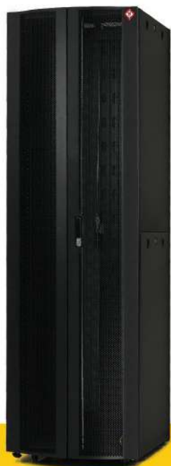
Double Front Door