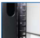
Mounting Pole w/screen UH