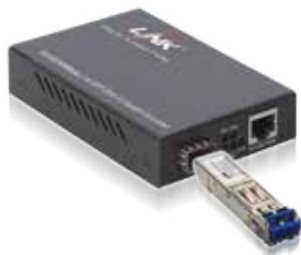
Use with Media converter

High density connections between networking equipment