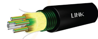
ARSS, SINGLE JACKET UFCX7XXMA