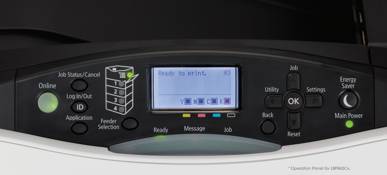
* Operation Panel for LBP843Cx.