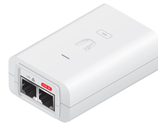
POE-24-24W-G-WH POE-48-24W-WH POE-48-24W-G-WH