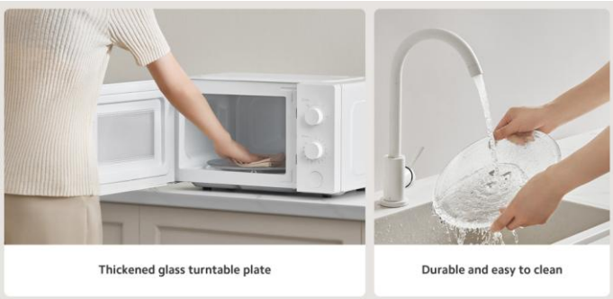
Thickened glass turntable plate