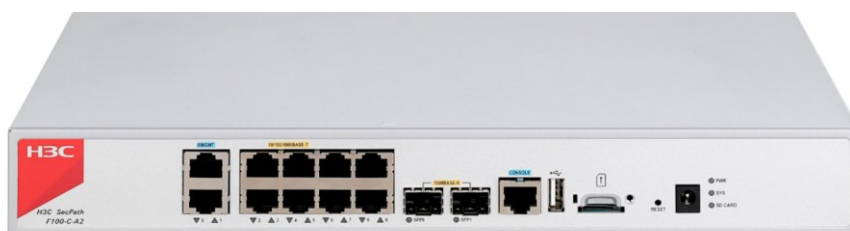
H3C SecPath F100-C-A2 firewall